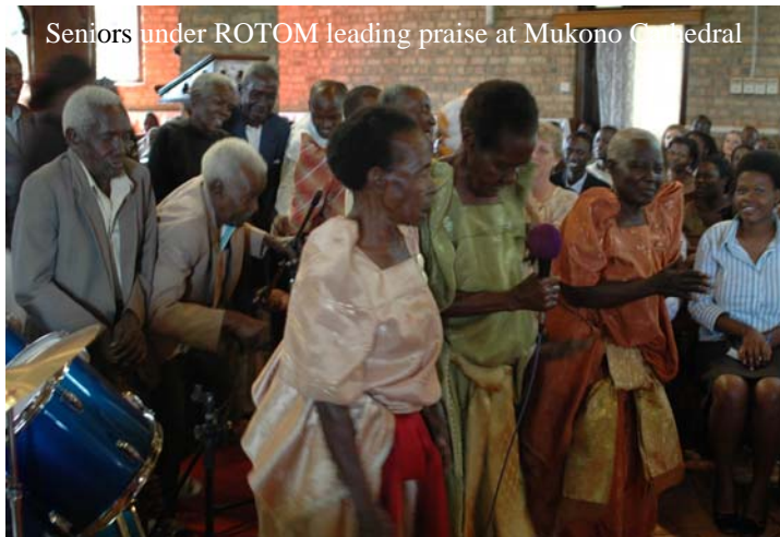
Seniors under ROTOM leading praise at Mukono Cathedral

(remember, all the seniors under ROTOM are selected because they "Bana bange, mwekume!," he said, which means "my children, keep